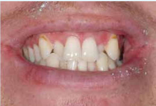
Before 6 Month Smiles

Using clear braces and tooth coloured wires they are discreet and the average time for treatment is only 6 months! We're offering FREE 6 Month Smiles consultations; just contact us to book your appointment.