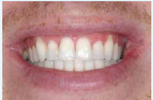
The new smile!

Because everyone should be able to smile with confidence